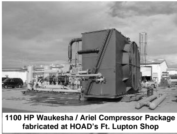
1100 HP Waukesha / Ariel Compressor Package fabricated at HOAD's Ft. Lupton Shop

UE Compression: HOAD, recently completed the fabrication work for and assembly of 2 compression units for UE Compression. The first of the two units completed was